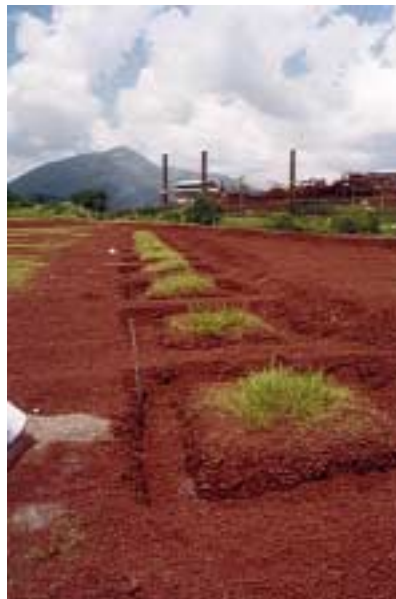
Fig. 3: Test areas for land reclamation without the use of top-soil

It is also possible to reclaim red mud disposal sites without using top-soil if selected types of grasses are used. In such cases, research projects are carried out and plants from various sources are investigated in test areas to evaluate their suitability for the intended application ( Fig. 3 ).