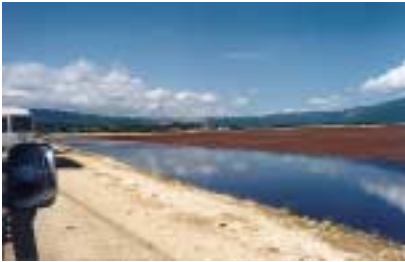
Fig. 2: Caustic soda collection

and therefore it also has to be imported. Jamaica is Germany's most important alumina supplier, accounting for over 50 percent, and it is also the world's fourth largest producer.